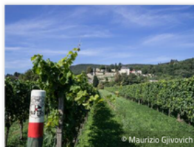
WEINGÜTER & VINOHEKEN