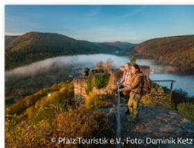
AKTIV & NATUR (UNESCO)