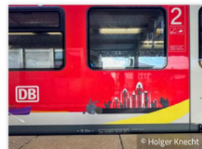
ANREISE & PARKEN