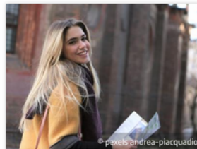
TICKETS FÜR ÖFFENTLICHE FÜHRUNGEN