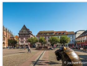
WEBCAM & IMPRESSIONEN