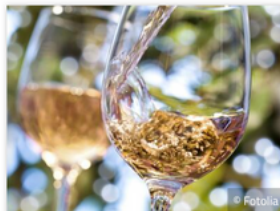
TOP EVENTS & AKTUELLES