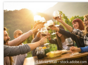
REISEGRUPPEN & FIRMENEVENTS