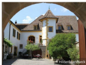
SCHLAFEN & WOHNEN