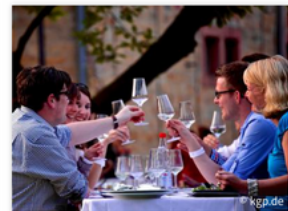
GASTRONOMIE & REGIONALES